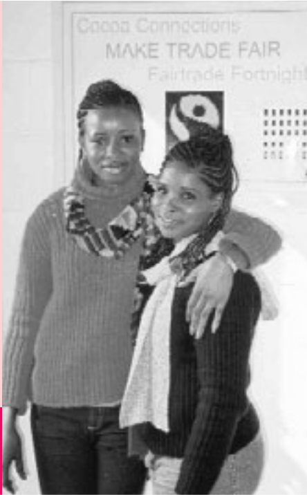
Ghanian cocoa growers in Bristol

national coverage. Media techniques include use of celebrities, like Chris Martin of Coldplay and staging stunts and other events. Oxfam activists are vital at a local level in expressing and creating public awareness. They visit local MP's in their constituencies, contribute to events and write to local