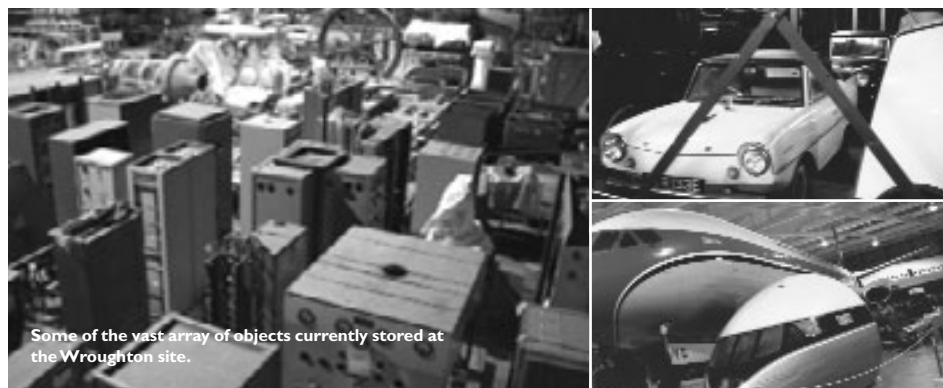
Some of the vast array of objects currently stored at the Wroughton site.

The Knowledge Farms will look at key areas of sustainability such as industry, agriculture and communities and are intended to be as practical as they are informative. I am told that they hope to produce enough energy and food to make the site entirely self-sufficient. "The essence of the message is that people will leave here with a sense of hope, feeling positive about the future. Of course we're going to talk about the problems and what we're doing to our planet but we're also going to be talking about solutions, and developing new solutions through science and technology."